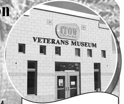
ITOW Veterans Museum 805 W. Main, Perham, MN