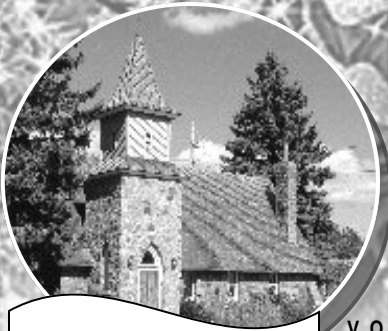
History Museum 230 1st Ave. N., Perham, MN